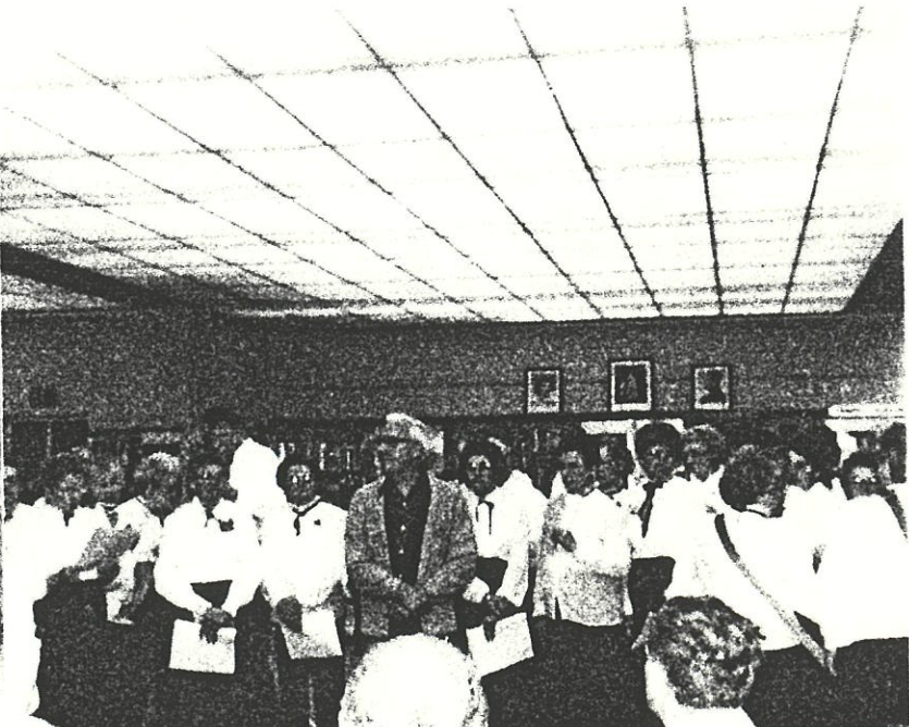
Annual Senior's Christmas Party