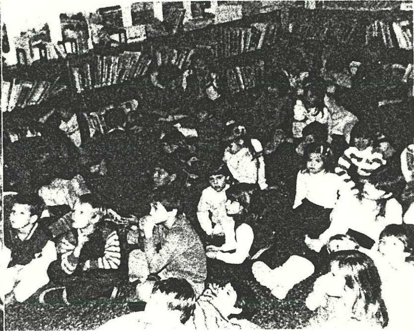
Christmas Film Festival & Santa's Visit