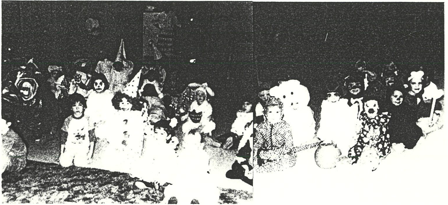
Story Hour Halloween Party